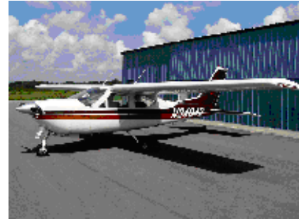
For Sale 1976 Cessna Cardinal RG $59,900 Oxnard Airport, CA