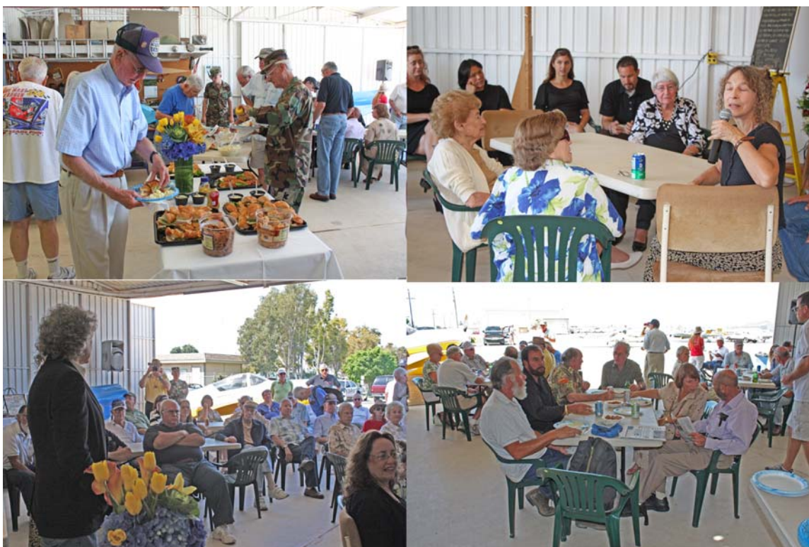
Friends and relatives enjoyed a buffet lunch at the hanger.